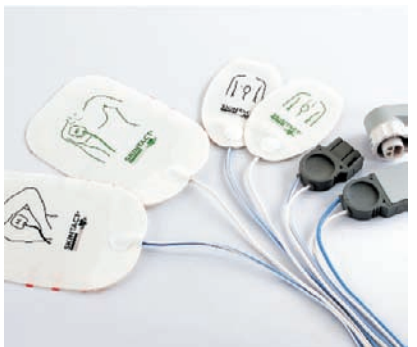
Adult and pediatric multifunction defibrillator pads fit the needs of a variety of departments.