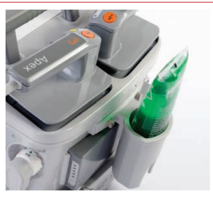
Gel holder is intended to hold gel tube and fixed on the back of D3 for easy taking.