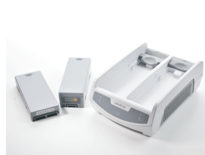
The two compartments charger is compatible for batteries of both BeneHeart D6 and D3.