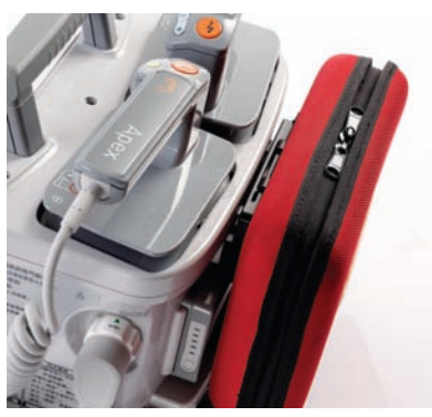
Optional accessory bag is fixed on the back of D3 for accessory pouching and is removable if